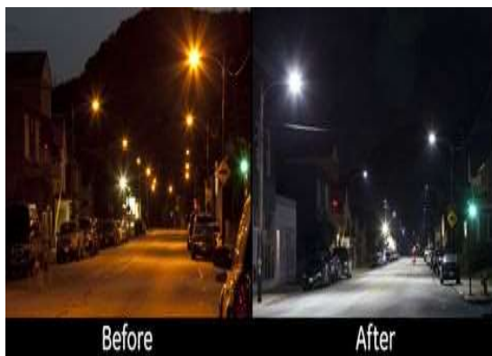
Figure 4 – Today vs Future

Lifi is in its developmental stage , and can still achieve greater levels and speeds clubbed with availability and more reliability along with enhanced security measures . Development in the Near field communication can be made through this. Also we may turn our street lights into potential modern age cellular towers, enhancing network opportunities.